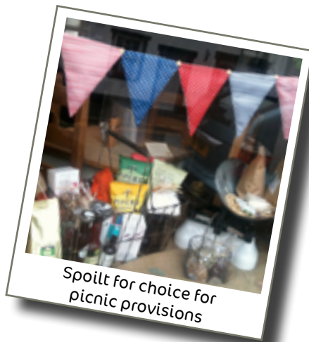
Spillt for choice for picnic provisions

There are many short routes you can take right from the market square. Visit Broughton TIC for ideas or try the old railway route. This easy route along an accessible track is great for all abilities. There are benches along the way if you want a rest while the adventurous ones carry on. Of course, no Lakeland walk would be complete without a pint of local ale at the end - luckily the friendly pubs in Broughton have a great selection!