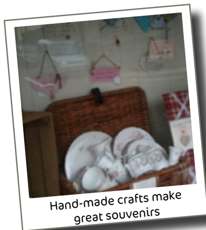
Hand-made crafts make great souvenirs

Enjoy this peaceful corner of the Lake District