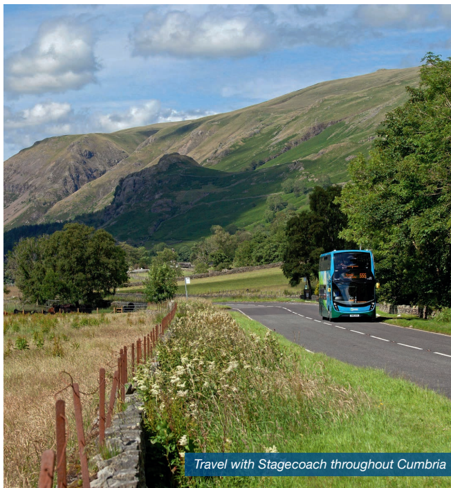
Travel with Stagecoach throughout Cumbria