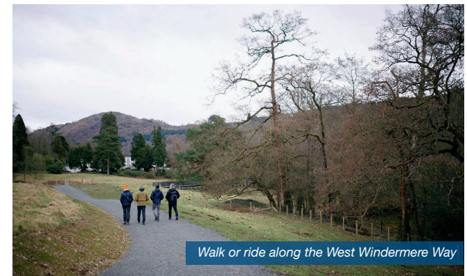
Walk or ride along the West Windermere Way

Lakeside also marks the start of the newly created West Windermere Way: an accessible, one-mile route which will run between the Lakeside Ferry Terminal and the Swan Hotel 4 in Newby Bridge. The first section, opened in